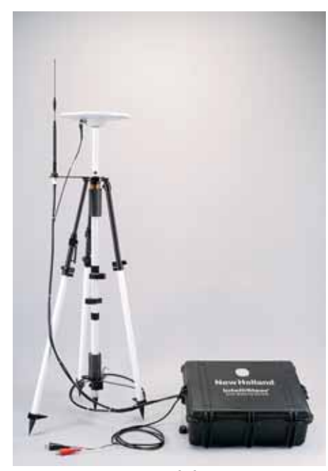
The RTK base station includes a GPS antenna, receiver and radio link to provide RTK correction signals to tractor-mounted auto-guidance systems and can be either portable or permanently mounted.